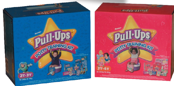
Pull-Ups potty training kits for Kimberly-Clark.