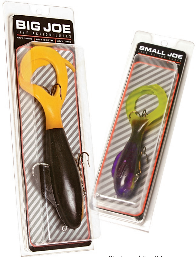
Big Joe and Small Joe fishing lures (we also did Mini Joe and Mo' Joe) for Live Action Lures.