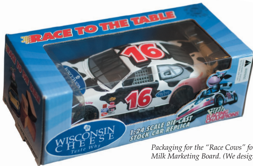
Packaging for the "Race Cows" for The Wisconsin Milk Marketing Board. (We designed the car, too!)