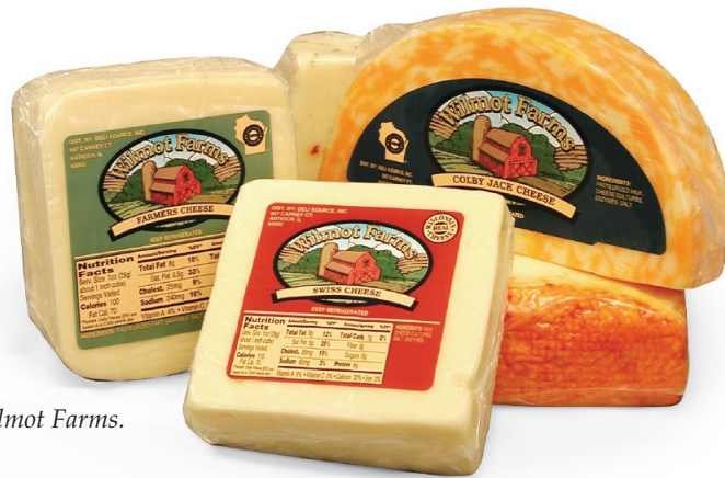
Cheese labels for Wilmot Farms.