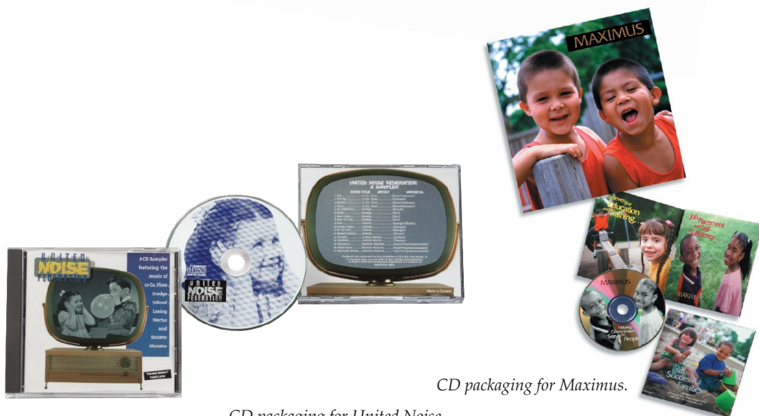
CD packaging for United Noise.